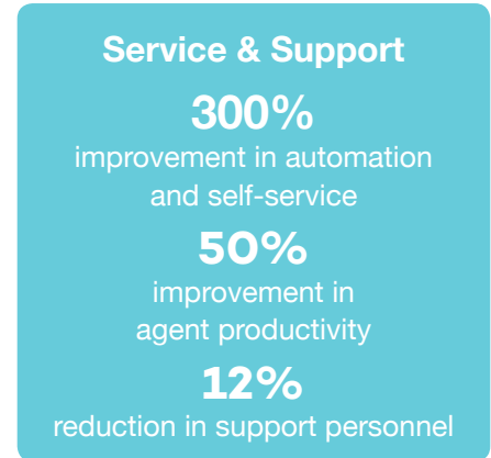
Results potential via bots