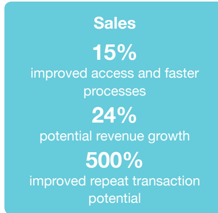
Results potential via bots

Admin tasks and distractions aren't just inconvenient. They cost companies 55% of employees' time every day.